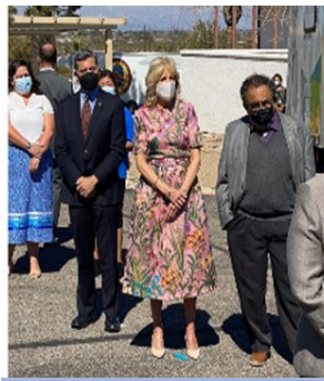
First Lady, Dr. Jill Biden